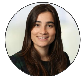
Lyle Roddey Maternity Support Team