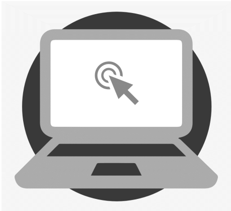
Live ASCR demos