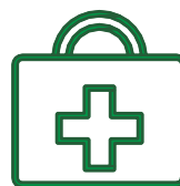
Emergency Care & Urgent Care